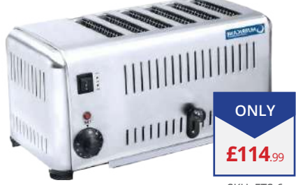
6 Slice Toaster

2 or 4 slice option with timer controls & manual release lever. 225(h) x 460(w) x 210(d)mm. 1 year warranty.