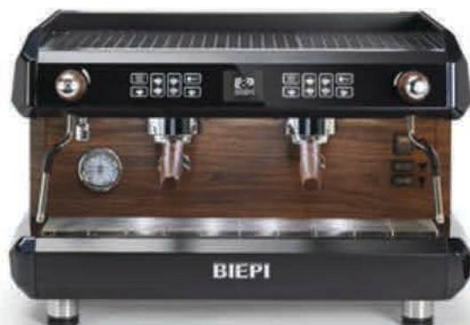
Black • Wood*