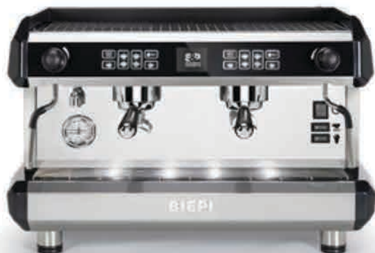
Black • Stainless steel