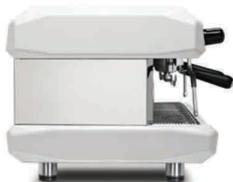
White • Stainless steel