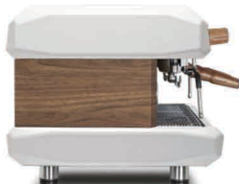
White • Wood*

* The 3M™ DI-NOC Dry Wood Matte adhesive finish ensures excellent resistance to stains, abrasion, wear and tear, and mould. DI-NOC finishes are CE branded according to the 89/106/EEC construction products directive and tested according to the EN 15102: 2008 decorative wallcoverings standard. The "Dry Wood Matte" family faithfully reinterprets the tactile qualities of wood in a completely natural way. Does not contain real wood.