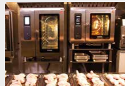
Chicken on the Bone Cooking method: Crisp&Tasty 22 kg in 30 minutes