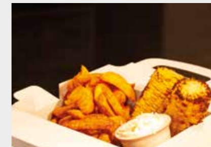
French fries Cooking method: Convection 18 kg in 18 minutes