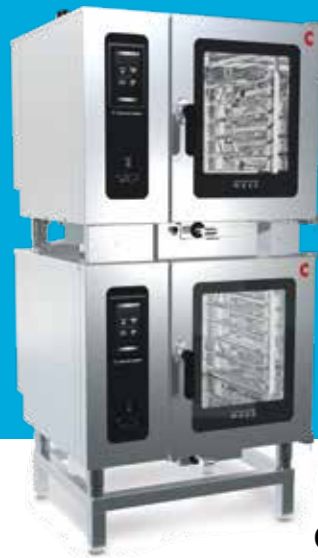
Quantities in a Convotherm maxx 10.10: