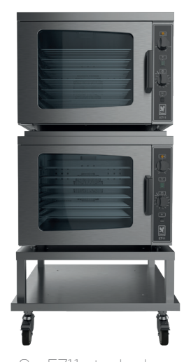
2 x E711 stacked on mobile stand

A clearance of 150mm should be observed between appliance and any combustible wall.