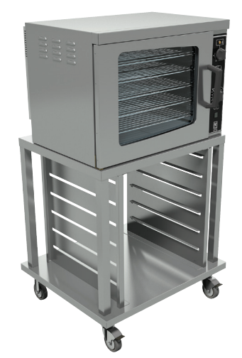
E711 on mobile stand