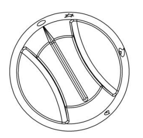
PILOT / Ignition