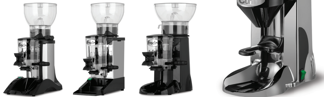
● Model B ● Model T ● Tranquilo Black ● Tranquilo-tron

The models T and B grinders have polished stainless steel cases and are ideally suited to the Fracino range of espresso coffee machines. The models T, B and Tranquilo grinders are operated manually by an on/off switch. All grinders have adjustable grinding blades and coffee portion control. Coffee is dispensed into the filter holders by means of a flick lever mechanism. The Tranquilo grinder is also available in a chrome option and as a single shot grinder for the freshest coffee. A tamper would be required for this option.